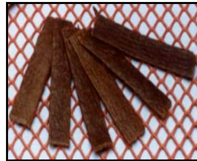
Polypropylene Screen (220°F Service Temp)

USDA-Approved Teflon Coated Fiberglass: Smokehouse non-stick screens that offer superior release, flexibility, dimensional stability and thermal resistance. Sealed edges included.